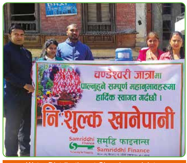
Water Distribution at Chandeswori Jatra

Dustbin and Chair distribution by Pokhara branch