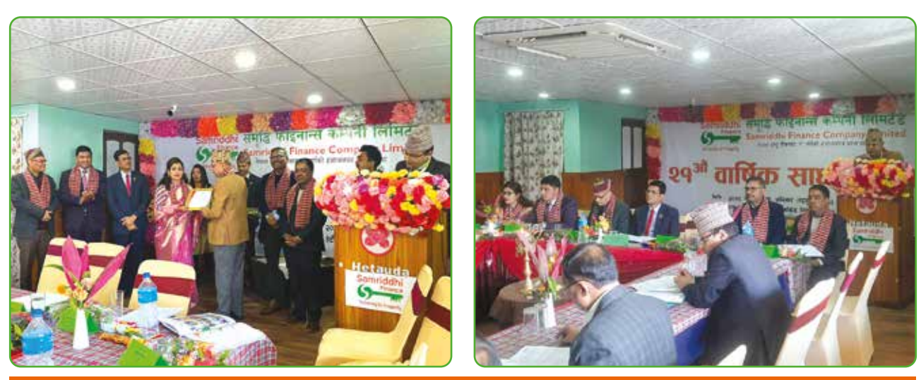
21<sup>st</sup> AGM at Hetauda