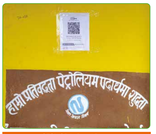
SFCL QR in Petrol Pump