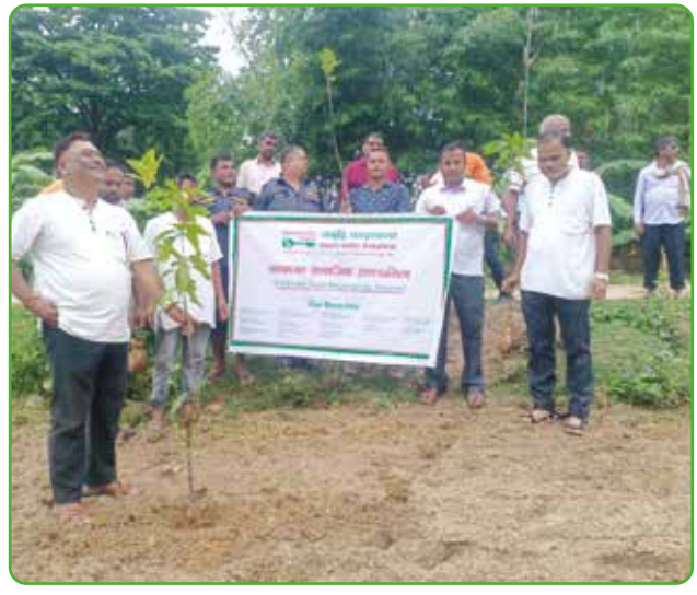
Tree plantation by Kasaha branch