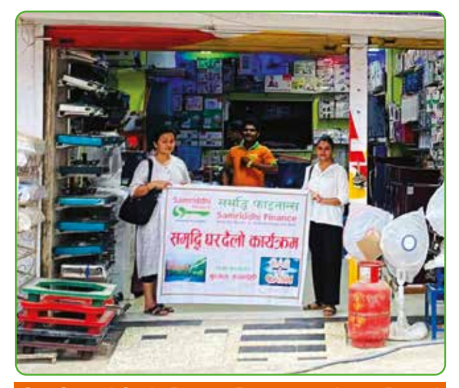
Gas Sangai Cash, Door to Door campaign at Butwal