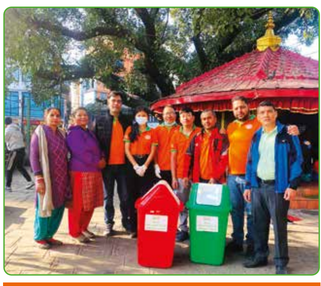
CSR program at Nagpokhari