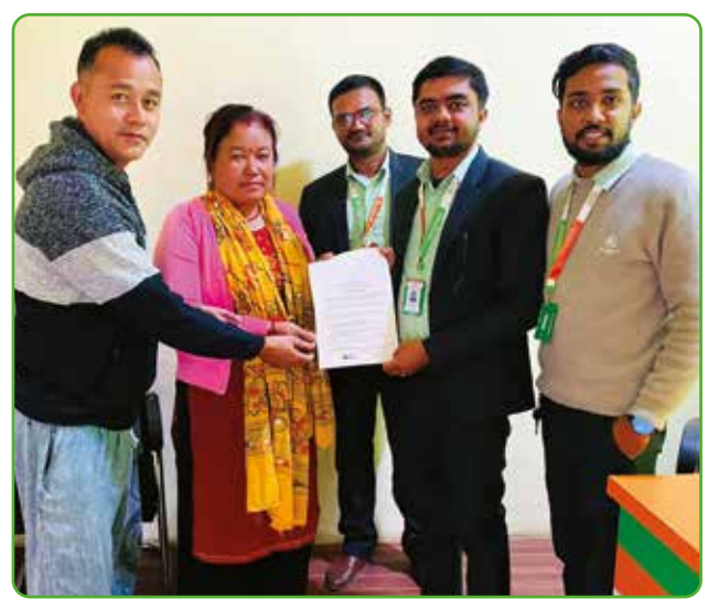
Agreement with Hamro Dudh Dairy -Kharendrapur