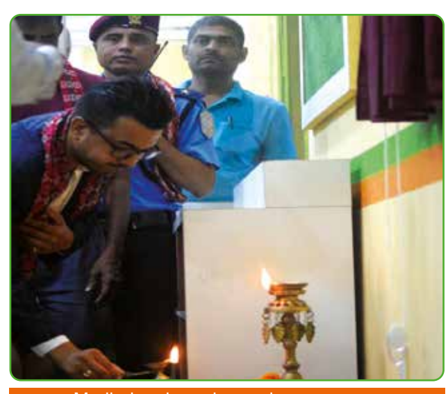
Madhuban branch opening ceremony